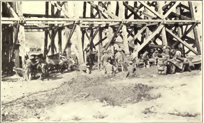
THE CORRAL AT THE CEMENT PLANT